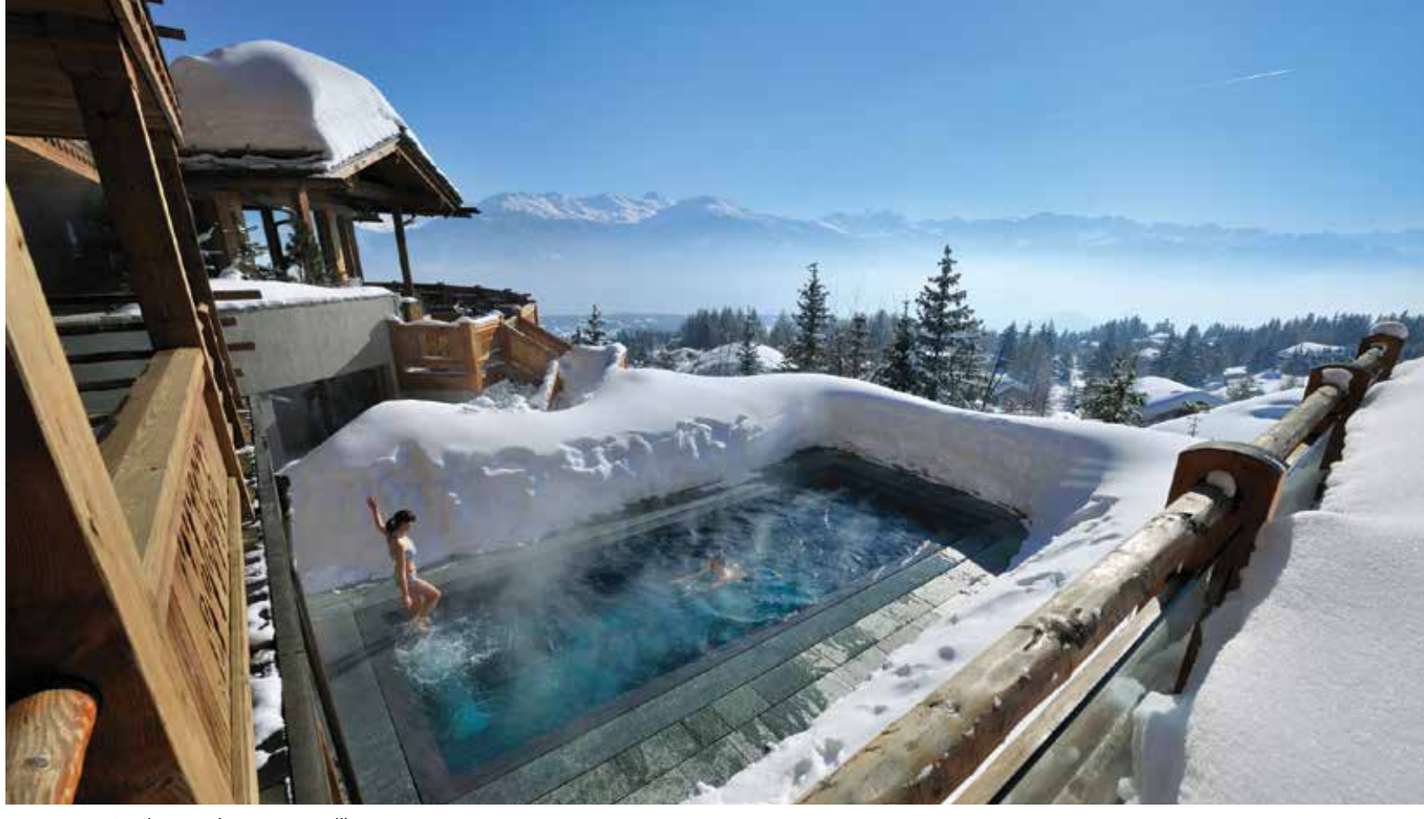
OPPOSITE PAGE: The magnificent 36.5° Wellbeing & Thermal Spa at Grand Resort Bad Ragaz. THIS PAGE: Relax in the outdoor pool at LeCrans Hotel & Spa

well-being that 40 million Swiss francs were invested in 2009 to build a contemporary Spa Tower housing 56 Spa lofts and suites. Exclusive features of the spa suites include bathrooms with colour therapy light settings, large oval Jacuzzi tub, rain shower with either steam bath or sauna and Tamina thermal waters feeding all of these. Spa Suite guests can relax in a reception-level lounge and enjoy fruits, hot beverages and waters from all over the world (although the delicious Tamina water directly from the tap will surely please most). At the 36.5° Wellbeing & Thermal Spa, all rituals honour the importance of water and the Sequoia Ritual is no different, beginning with a foot bath and scrub with Sequoia oil and heated alpine herb poultice of the body. The 90-minute treatment will leave you feeling as rooted as the two gigantic Sequoias at the entrance of the resort, hailed for their powerful energy. With a long history