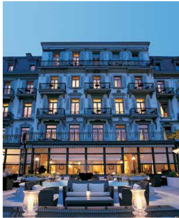
THIS PAGE: Enjoy the spectacular panoramic views of nature at Kulm Spa St Moritz; Hôtel des Trois Couronnes is one of Switzerland's oldest prestigious hotels. OPPOSITE PAGE: The stunning Six Senses Spa at Alpina Gstaad

looking for delectable terrace dining with enchanting views of the lake and mountains. www.hoteltroiscouronnes.ch